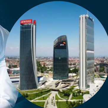
Citylife Metro "lilla-line" » "Tre Torri" Metro "Red-line" » "Amendola"